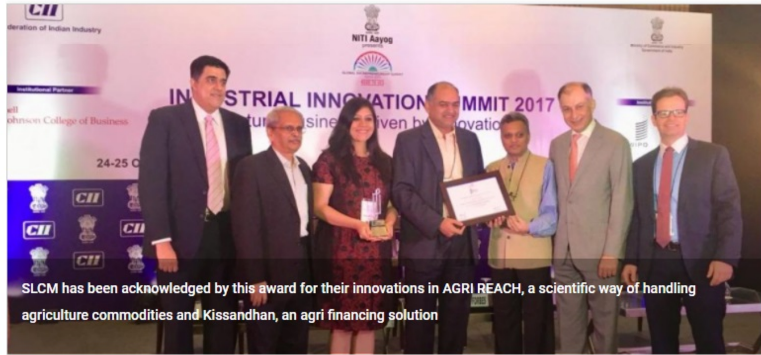
SLCM has been acknowledged by this award for their innovations in AGRI REACH, a scientific way of handling agriculture commodities and Kissandhan, an agri financing solution

25 October 2017 Author: RM Bureau Section: Industry Category: Agriculture