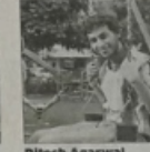
Ritesh Agarwal OYO Rooms, Gurgaon