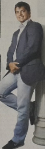
Bhavish Agarwal Ola, Bengaluru