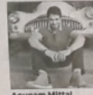
Anupam Mittal Angel Investor, Mumbai