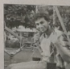
Ritesh Agarwal OYO Rooms, Gurgaon