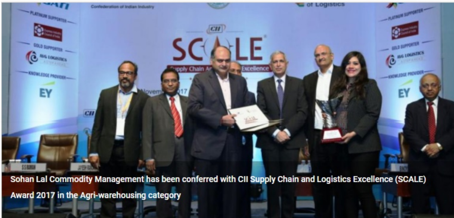
Sohan Lal Commodity Management has been conferred with CII Supply Chain and Logistics Excellence (SCALE) Award 2017 in the Agri-warehousing category

27 November 2017 Author: RM Bureau Section: News Category: Agriculture