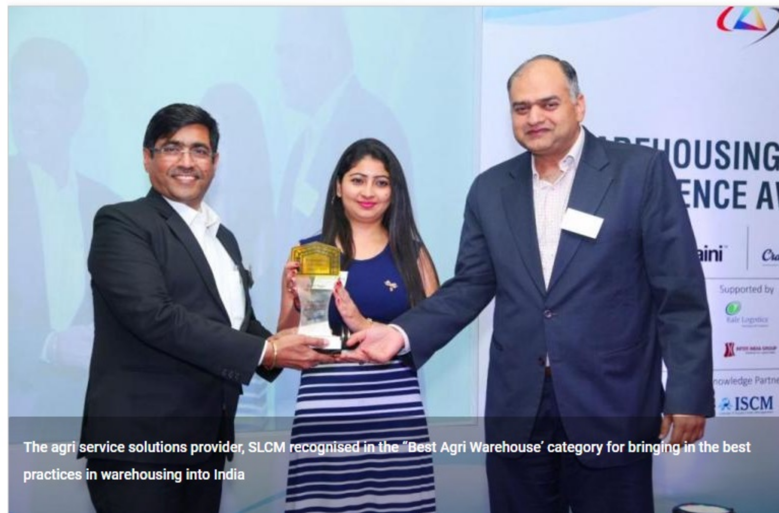
The agri service solutions provider, SLCM recognised in the "Best Agri Warehouse" category for bringing in the best practices in warehousing into India

19 March 2018 Author: RM Bureau Section: Industry Category: Agriculture