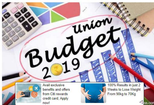
Budget 2019 India: Finance Minister Nirmala Sitharaman will unveil the full budget for the fiscal 2019-20 on July 5.

Budget 2019-20: Days ahead of the Union Budget, agri-warehousing companies have sought waiver of the 18 per cent GST imposed on such services to boost the farming community. "The Centre should relook at the GST on agri-warehousing services."