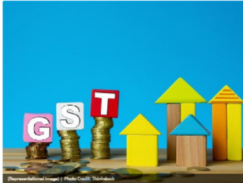
(Representational image)