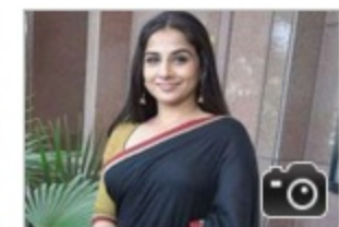
Overweight Bollywood Divas