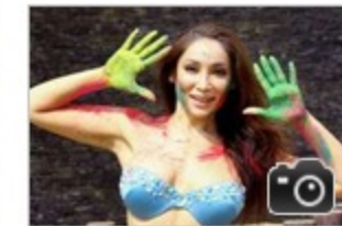
Holi with Sofia Hayat!