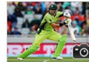
Pakistan vs South Africa IN PICS