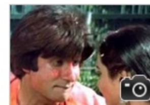
Add music to colours: Here are top Holi songs