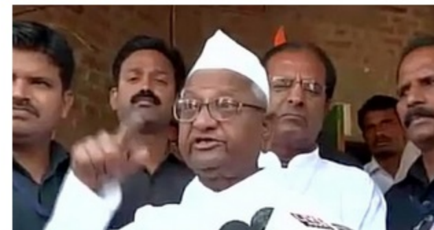
Govt should take back Land Acquisition Bill: Anna Hazare